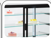
Rear sliding doors in Thermopane glass