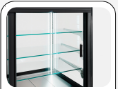
Refrigerated glass shelves